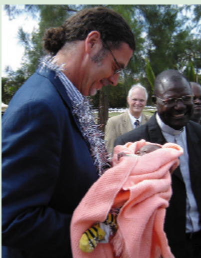
Left, the German ambassador to Kenya cuddles one of the “outputs” of the project his country is funding, while, right, voucher distributors get ready for the job.

Republic of Kenya, Internal Review Report of the RH-OBA Project in Kenya , June 2007.