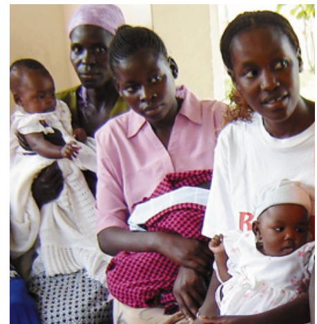
Mums and babies attend clinic

The slower uptake in Kitui is attributable to the poor road network and distribution of